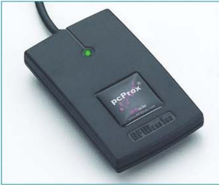
PC Log-in Reader