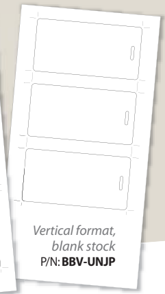
Vertical format, blank stock P/N: BBV-UNJP