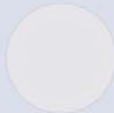
Clear Half-Day Expiration Item# 08141

Packaging: 1,000 Badges & 1,000 Timing Covers Size: 2 x 3" (5.08 x 7.62cm) badge Expiration: Half-Day and One-Day