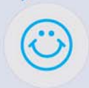
Smiley Face Half-Day Expiration Item# 08140