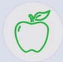
Apple One-Day Expiration Item# 08143