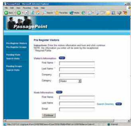
PassagePoint Enterprise v4.5's Web Pre-Registration module lets employees pre-register visitors

"We know exactly what's going on in our lobby, thanks to PassagePoint... PassagePoint works!"