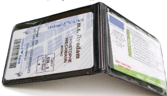
501-N2 Double-Pocket Holder