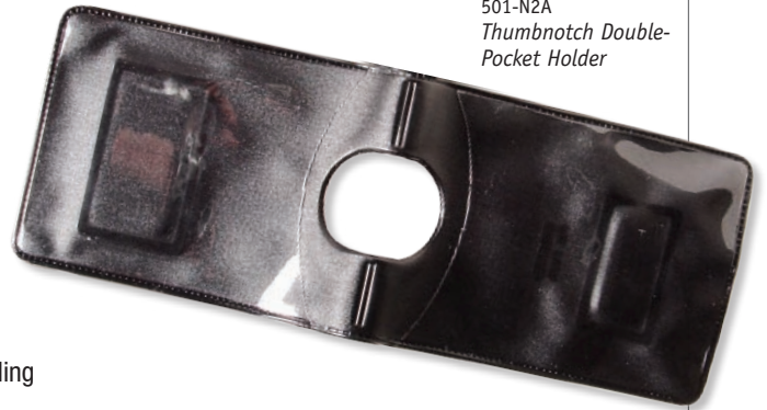
501-N2A Thumbnotch Double-Pocket Holder

Available with pad printing only For custom imprinting lead-time applies.