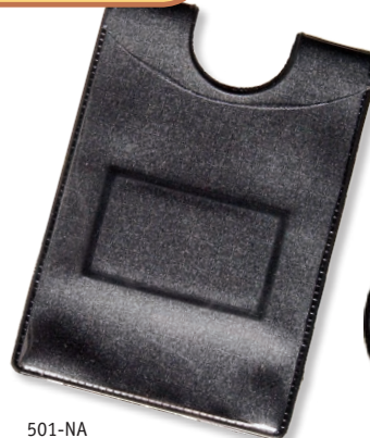
501-NA Thumbnotch Holder

All magnets are shielded, so they WON'T ERASE magnetic stripes on IDs and credit cards!