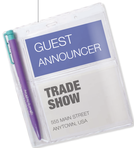
306-4P56 Features three pockets on front and a fourth full-length pocket on back. (Pen not included)