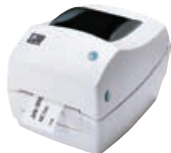
Zebra TLP 2844 06173