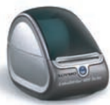
Dymo 400 Turbo 06165