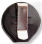
Standard Slide Clip