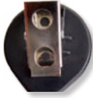
Swivel Bulldog Clip