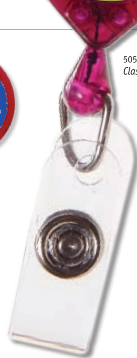
505-MB Classic Mini-Bak